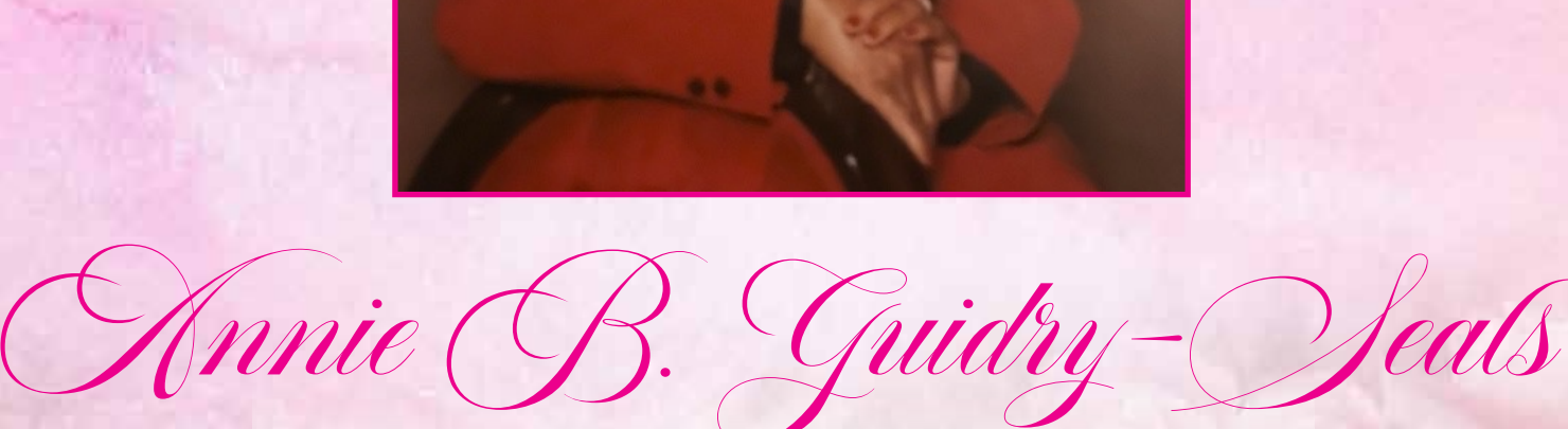
Alpha: February 11, 1934 ~ Omega: January 1, 2024

205 FIDELITY ST. HOUSTON TX. 77029 713.223.4966